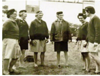
Switzerland Sub camp staff and Division Commissioners.

This was the South East (Sandbach, Alsager) and South Division (Crewe and Nantwich) camp.