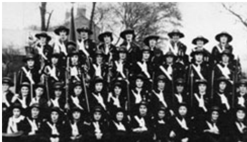
1st Alderley Edge Guides 1910 -1911. Third oldest company in the world