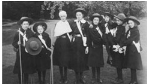
1st Alderley Edge Guides 1911

In Dec 1913 Miss Agnes Baden-Powell (B.P's sister) 'reviewed' the Alderley Edge Company. The local Advertiser described it as 'an epoch-making event which took place in the Wesleyan School... the company is the most efficient in the county'.